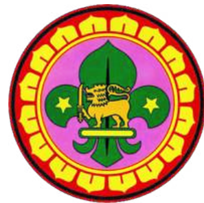
Sri Lanka Scout Association