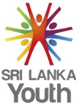
National Youth Services Council