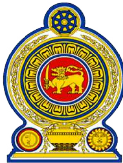
Ministry of Social Services

V Awards is a project initiated in 2011 marking the 10th anniversary of the International Year of Volunteers. The concept behind this project is to recognize individuals who make extraordinary and selfless contributions to society at large and reward the most outstanding volunteers at national level. The United Nations Volunteers programme together with News 1st and in collaboration with the Ministry of Social Services' National Volunteer Secretariat and the National Steering Committee on Volunteering have organized this initiative to provide volunteers across Sri Lanka a platform to share their stories, showcasing volunteerism. The awards ceremony recognizes the "Volunteer of the Year 2013" and the "Youth Volunteer of the Year 2013". A special trophy on "Volunteering for Water" will be awarded to commemorate 2013 as the International Year of Water Cooperation.