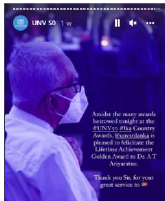
UNV Instagram Takeover

Youth Community Leadership Initiative to Advance Youth Capacity