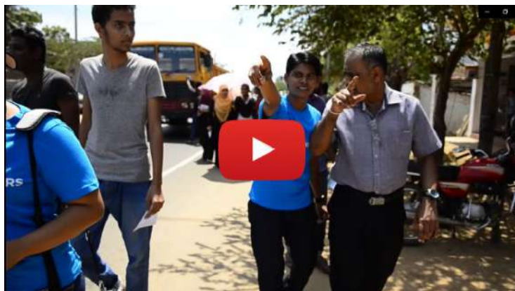
Partnership: the key to our success

UNV launched the e-version of the 'UNV at 50' Coffee Table Book highlighting milestones of the volunteer journey in Sri Lanka and showcased a video highlighting the importance of partnership . In addition, UNV Sri Lanka provided live coverage of the UNV50 Country Awards through UNV global Instagram takeover and live tweets , and the highlights of the day were updated on our social media channels. Pictures of UNV50 Country Awards of Sri Lanka can be viewed here .