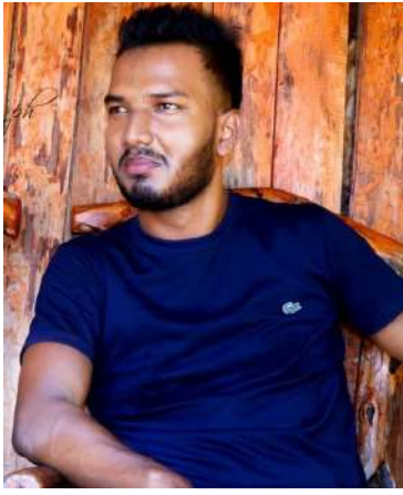
Community Volunteer Development Coordinator (Anuradhapura) - UNV

"I am very happy to have the opportunity to work with the UNV family again as a Community Volunteer after serving as Community Volunteer - ESA Project with UNDP. I wish everyone good health."